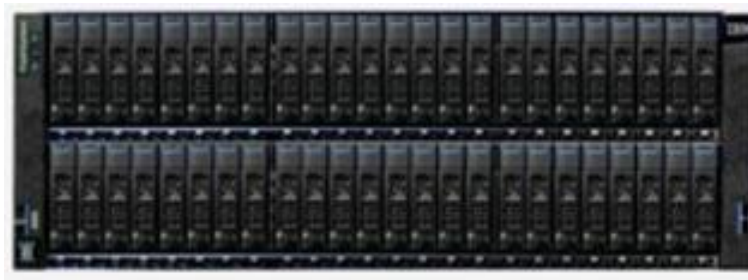
Figure 1: IBM FlashSystem 9500 Enclosure for SSD & FlashCore Modules

FlashSystem 9500 is an Intel-based dual controller system. Each controller pair is packaged with up to 48 NVMe devices in 4U. FlashSystem 9500 supports both standard NVMe SSDs as well as custom devices called FlashCore Modules and storage class memory. The system supports up to a max of 48 front end host ports with support for FC, NVMe-oF/FC, iSCSI, and NVMe-oF/RDMA. Additionally, FlashSystem 9500 supports up to 4-way clustering for increased scalability.