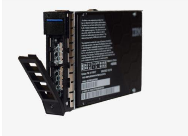
Figure 3: FlashCore Modules